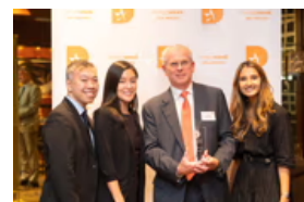
HEDGEWEEK EUROPEAN DIGITAL ASSETS AWARDS 2022