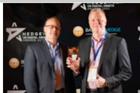
HEDGEWEEK US DIGITAL ASSETS AWARDS 2022