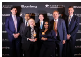
HEDGEWEEK US DIGITAL ASSETS AWARDS 2023