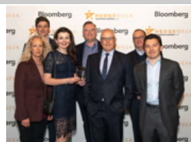
HEDGEWEEK EUROPEAN AWARDS 2022