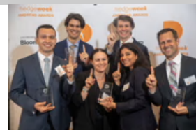
HEDGEWEEK AMERICAS AWARDS 2021