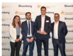
HEDGEWEEK EUROPEAN AWARDS 2023